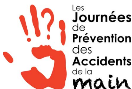
Fig. 1 Logo for the prevention campaign featured on all documents.