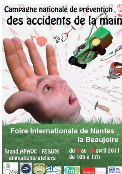
Fig. 3 Example of a poster produced for the occasion of a town event.