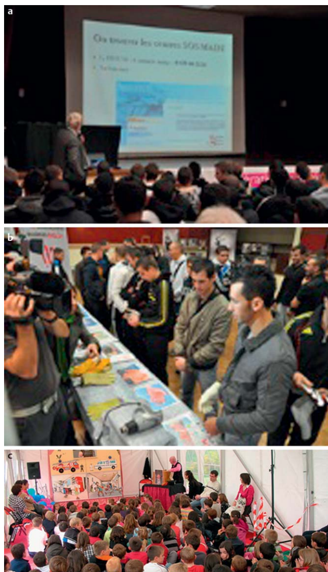
Fig. 2 3 actions carried out during an event: a public conference, b glove workshop, c theatrical animation for children.

A great deal of non-budgeted, physical support was given by Town Halls and Regional or Departmental councils for the holding and running the events: premises and sites were made available, a bus shuttle service was organised to transport pupils, and help was given to publicise the event in the local papers and public areas.